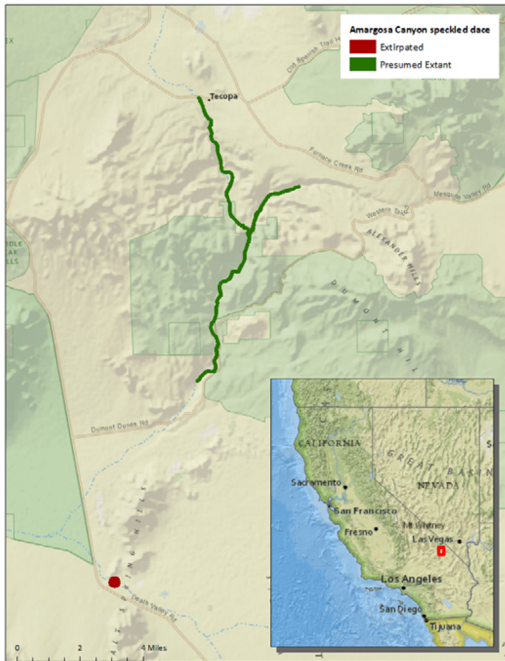
Figure 1. Amargosa Canyon speckled dace status. Created by CBD using locality data from Sada (1989), CAS (2020), CDFW (2020), UMMVZ (2020), and information from Moyle et al. (2015).

the greatest decline in dace abundance, with a 57% decrease in catch per unit effort from 2014 to 2016 (Davis and Halvorson 2016).