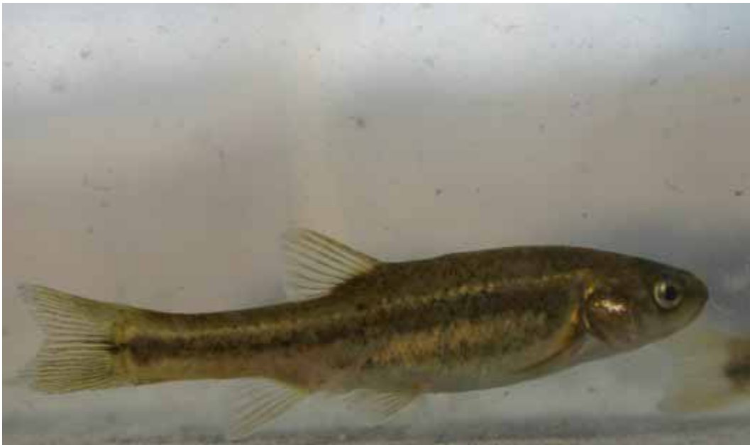
Owens speckled dace

Amargosa Canyon Speckled Dace Long Valley Speckled Dace Owens Speckled Dace