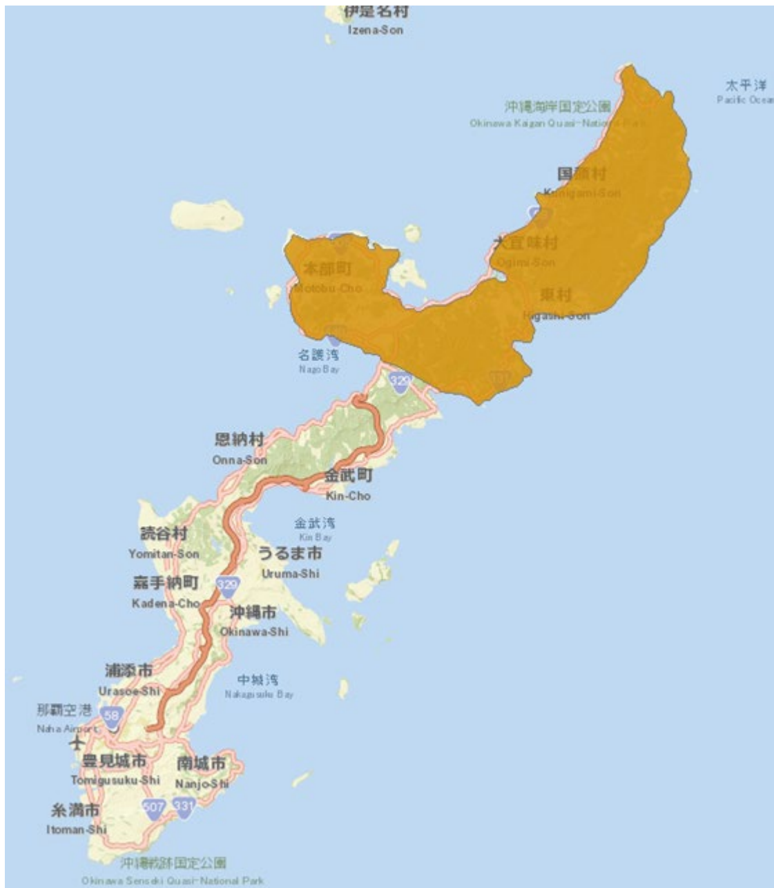
Figure 2. Current distribution of the Okinawa woodpecker illustrated by the shaded area in the north of Okinawa Island. (BLI 2017, unpaginated).