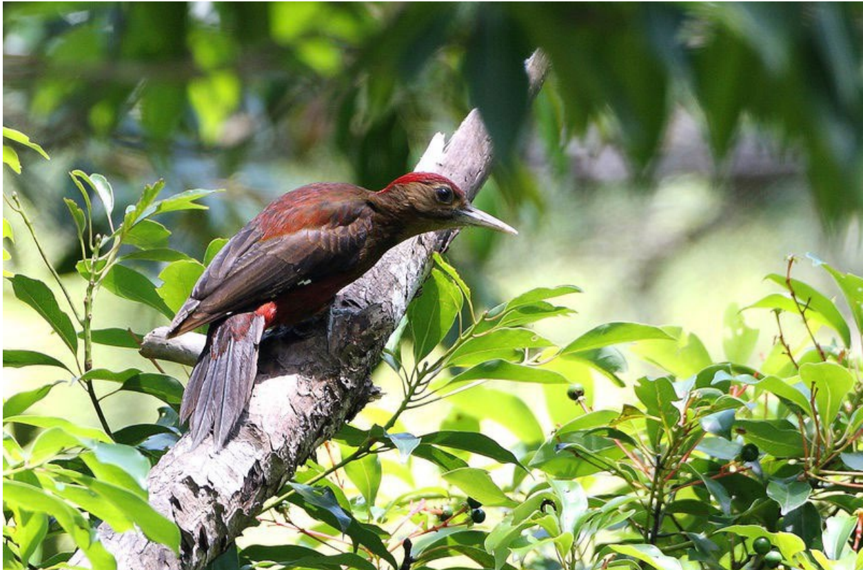
Figure 1: Image of the Okinawa woodpecker (Ambrosini 2008, unpaginated).

The Okinawa woodpecker is a relatively large woodpecker that is 31–35 centimeters (cm; 12–14 inches (in)) in length. It has a dark red belly and vent, and some red on the breast and mantle (BLI 2016, p. 1, Brazil 2014, p. 284; Figure 1). The species is generally dark brown with red tips on all feathers and white spots on the primary feathers (BLI 2017, unpaginated). Males are brighter than females, with a deep-red crown and nape (Brazil 2014, p. 284). Females have a brown crown that contrasts with pale brown on the sides of their head (Brazil 2014, p. 284). The Okinawa woodpecker is highly vocal year-round (Brazil 2014, p. 284).