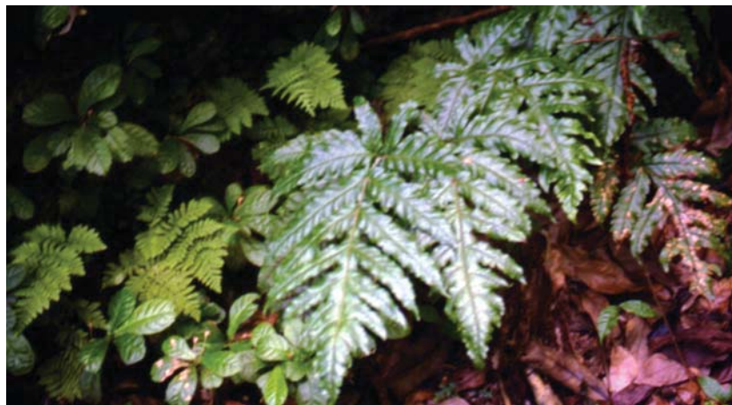
Tectaria estremerana

U.S. Fish and Wildlife Service Southeast Region Caribbean Ecological Services Field Office Boquerón, Puerto Rico