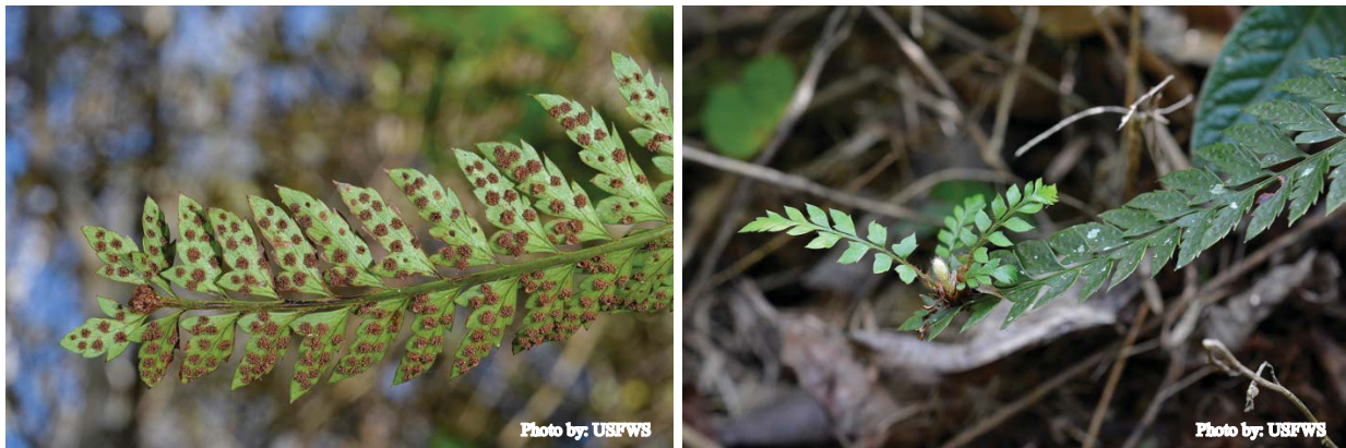
a) Fertile frond with sporangi.