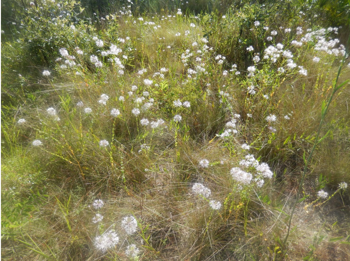
Seminole State Forest Warea Tract, Lake County.

U.S. Fish and Wildlife Service Southeast Region North Florida Ecological Services Office Jacksonville, Florida