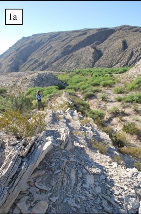
Figure 1. Photographic images of bunched cory cactus.