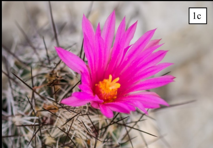
1a, b: Habitat. 1c. Flower. 1d: Mature plant. 1e: Adaptation to crevices.