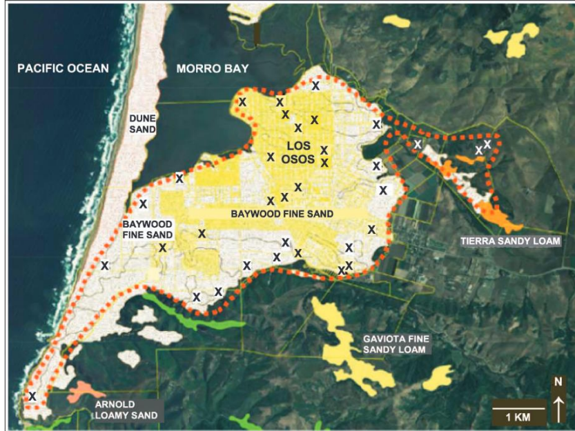
Figure 1. Distribution of sandy soils and the historical range of Morro Bay kangaroo rat (orange dotted line) in San Luis Obispo County, California. The yellow on Baywood Fine Sand indicates urban development as of 2007. Xs indicate where Morro Bay kangaroo rats were captured in Stewart’s 1958 distributional study. The Morro Bay sandspit is located between the Pacific Ocean and Morro Bay, labeled “Dune Sand”. This figure is from Kofron and Villablanca (2016).