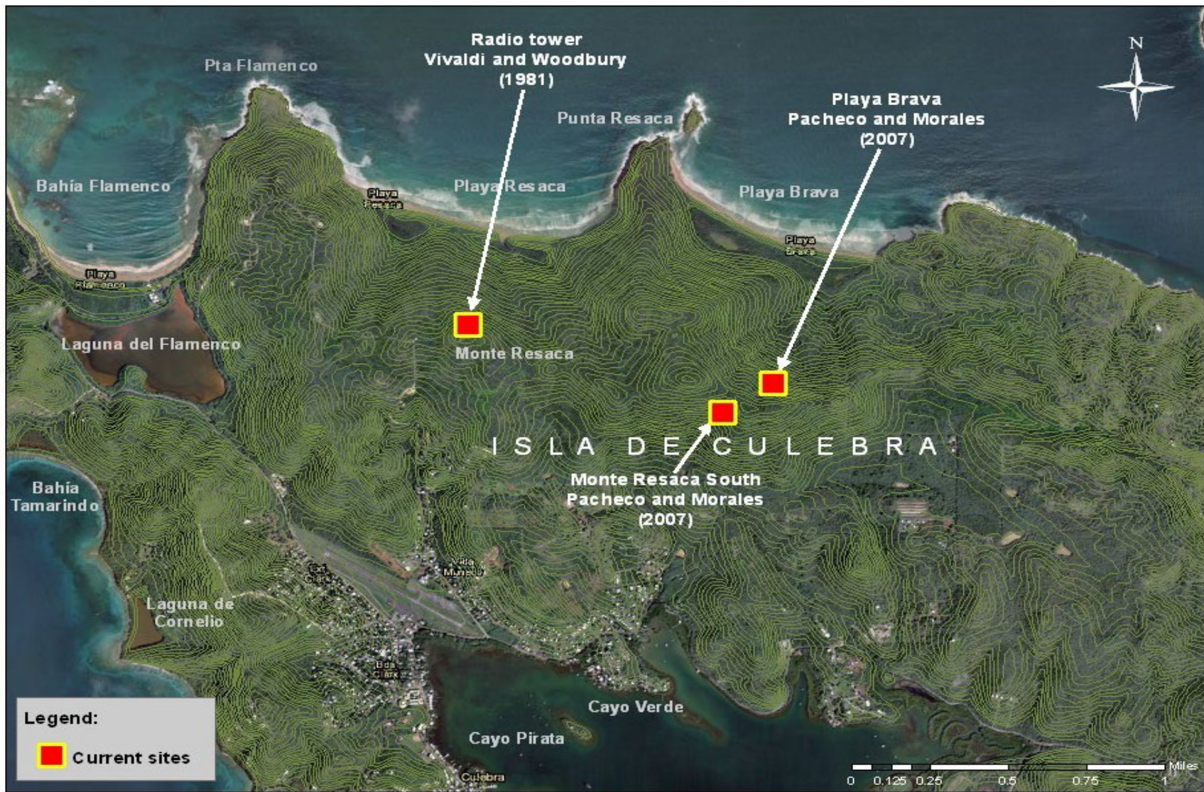
Figure 2. Current distribution of Wheeler's peperomia in Culebra Island (Pacheco 2007).