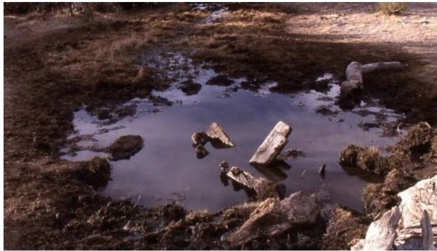
Figure 3. Photo of unnamed spring (about 0.5 kilometers [0.3 miles] north of Willow Spring) (from McCaffery and Phillips 2016).

The Chupadera springsnail was first documented at the unnamed spring by Stefferud (1986). Unfortunately, sampling conducted between 1995 and 1997 found no springsnails and significantly degraded spring habitat (Lang 1998, 1999). Biologists with TESH were able to survey the unnamed spring in November 2012, but no springsnails were observed (McCaffery and Phillips 2012). Springsnails are likely extirpated from this location (NMDGF 1996; Lang 1999).