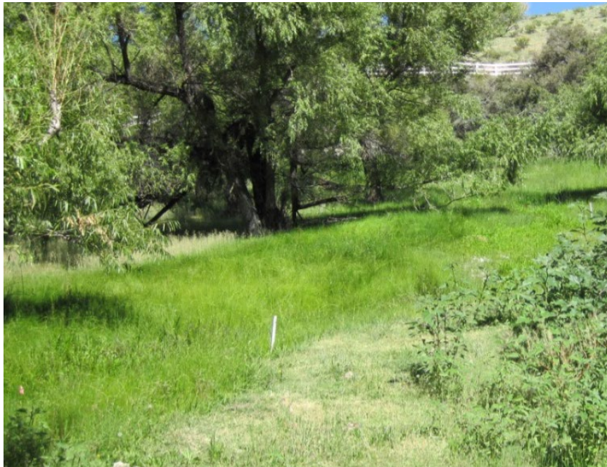
Figure 5. Photo of Willow Spring after fence erection to exclude cattle.