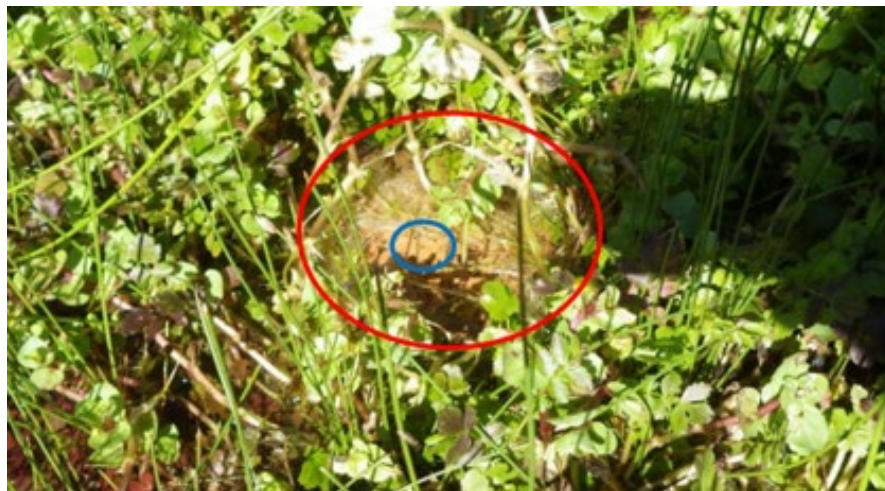
Figure 2. Natural unfinished Saltillo clay tile (large red circle) in springbrook vegetation with small Chupadera springsnails (small dark spots, some in smaller blue circle).

Historic surveys using '5" dots' (natural unfinished Saltillo clay tiles, Figure 2) show that springsnail populations were locally abundant and stable at Willow Spring through 1999 (Lang 1998; 1999), with average densities in 1997–1998 of 23,803 \pm 17,431 per square meter ( m^2 ; 2,211 \pm 1,619 per square foot) (NMDGF 2011). From 1999 through 2011, springsnail population status at Willow Spring was unknown (Carman 2004, 2005; NMDGF 2007). Qualitative information from the landowner was provided in response to the 2011 proposed rule (76 FR 46218). A springsnail according to the landowner (presumed to be the Chupadera springsnail) continued to occur at the springhead, although not in high numbers, and was abundant in the springbrook (Highland Springs Ranch, LLC 2011). Biologists from Turner Endangered Species Fund (TESF) were able to conduct surveys in November 2012. They detected springsnails at Willow Spring but not at the unnamed spring (McCaffery and Phillips 2012). Surveys conducted at Willow Spring in 2017, 2018 and 2019 by TESF and NMDGF using stratified transects counts saw similar numbers (20,183 per m^2 in March 2017, 62,200 per m^2 in May 2017, 32,383 per m^2 in August 2017, 43,383 per m^2 in November 2017, 31,000 per m^2 in March 2018, 25,630 per m^2 in June 2018, 24,380 per m^2 in August 2018, and 22,450 per m^2 in January 2019) to what Lang recorded back in the late 90s surveys (23,803 per m^2 ; Table 1).