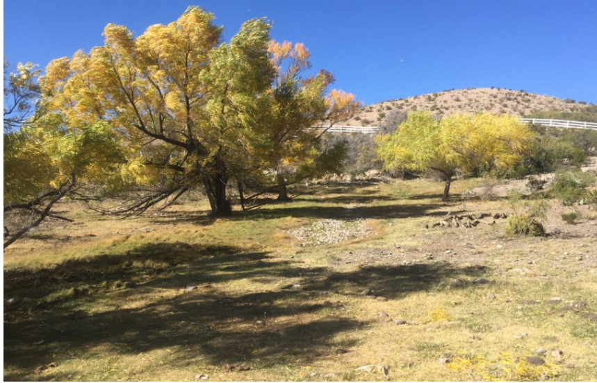
Figure 4. Photo of Willow Spring prior to fence erection to exclude cattle (taken late fall 2016).