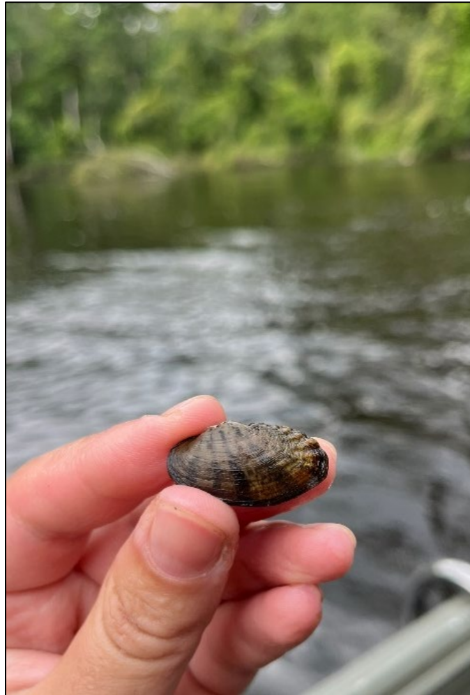
Adult Ochlockonee Moccasinshell ( Medionidus simpsonianus ) collected in the lower Ochlockonee River, Florida.

U.S. Fish and Wildlife Service Southeast Region Florida Ecological Services Field Office Panama City, Florida