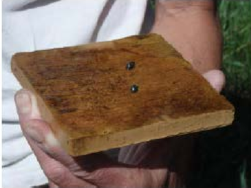
Figure 2. Natural unfinished Saltillo clay tile with two larger Physa sp. snails and several small Alamosa springsnails (visible as small dots on the tiles edge, from AMEC 2010).