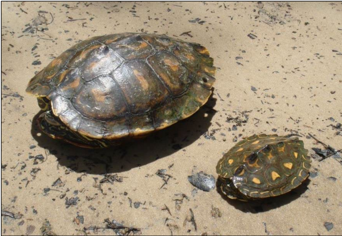
Yellow-blotched map turtles; adult female on the left and adult male on the right.

U.S. Fish and Wildlife Service Southeast Region Mississippi Ecological Services Field Office Jackson, Mississippi