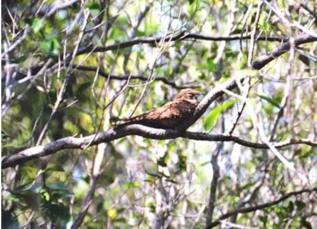
Figure 2. Puerto Rican nightjar individual observed by Service biologists Angel Colón-Santiago and Omar Monsegur in the Residential-Elderly Project proposed project site.

Also, during November and December 2021, Grieves et al. (2023), detected the calls of one or two Puerto Rican nightjars at four locations within the Cabo Rojo National Wildlife Refuge (NWR), along with an adjacent private property known as Finca Altamira, while conducting surveys for smooth-billed anis ( Crotophaga ani ) (Figure 3). Grieves et al. (2023) were able to record visual observations as well as audio of the species during their surveys. Detailed information about these observations can be accessed as a Trip Report on eBird at the following link: https://ebird.org/tripreport/111245 . The sites where these nightjars were detected are located in the south westernmost part of Puerto Rico, an area where breeding of the species was indicated as "probable" according to the Breeding Bird Atlas map (Castro-Prieto et al. 2021). This is the first published record of Puerto Rican nightjars in the Cabo Rojo NWR, confirming previous assumptions about their likely presence in the area.